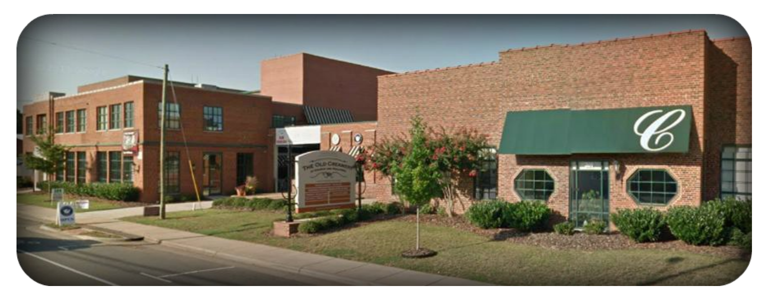
363 CHURCH ST N, SUITE 240-250, CONCORD, NC 28025